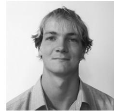
Australian 26 years of age

T: +61 405 808 347 E: jesse@lockhartkrause.com.au W: http://www.lockhartkrause.com.au